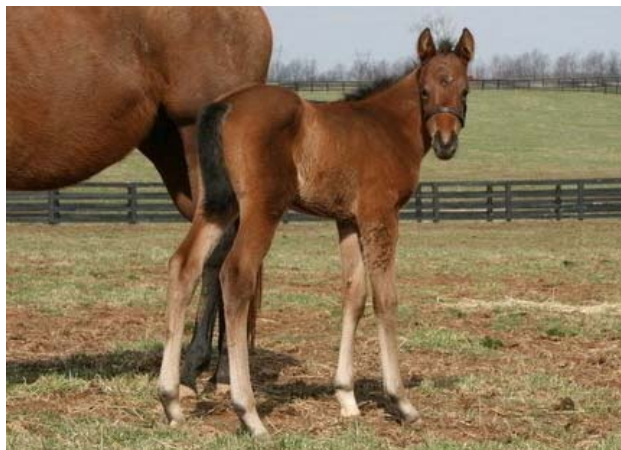
Forty Winks half sister by Colonel John foaled 2011

Many are quick to point to negative trends in handle, total purses, race availability, but statistically now is as good of time as one has seen in the past 40 years to be involved in the sport of horse racing. Certainly nationwide total purse numbers and overall offered stakes races have continued a year-over-year decline since the onset of the 2008 U.S. recession. However, these declines have not come close to keeping pace with the decline in the annual size of thoroughbred foal crops. The foal crop for 2012 is forecast to be the smallest in 40 years, about 24,700 total foals only slightly larger than in 1971 when there were 24,301 foals registered.