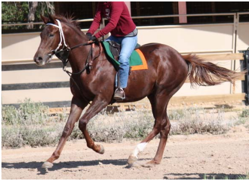
EFFOUR is set to return to training during the second week of January after a 60-day routine turn out.