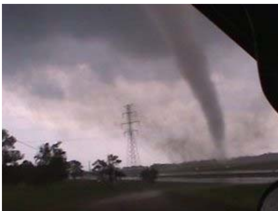
Click on the photo above to see some up close video of the Chickasha, OK May 24th Tornado