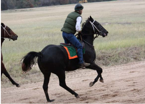
SASSY KISS is moving well over the track and has given us nothing but positive signs indicating she is ready to keep pressing towards an early two-year-old start.