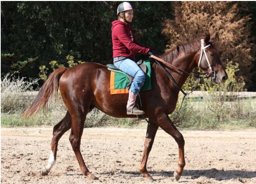
Effour in October 2011