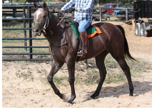
WHY ROCK is growing taller by the month and continues to spend time away from the track as she is given the opportunity to grow into a later developing form.