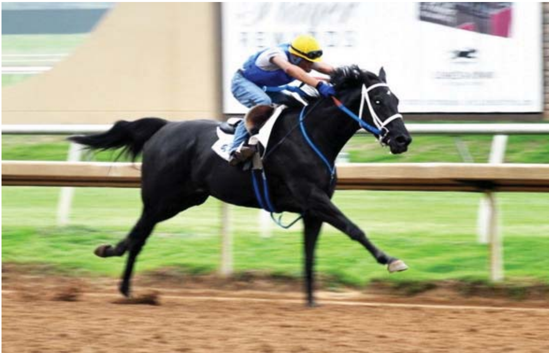
Sassy Kiss Breezing May 31, 2013