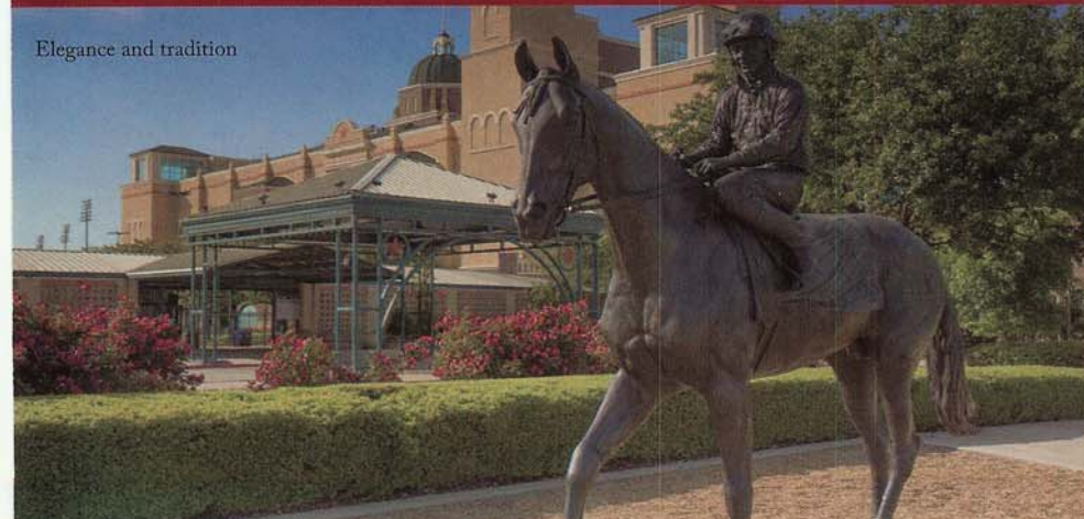
Elegance and tradition