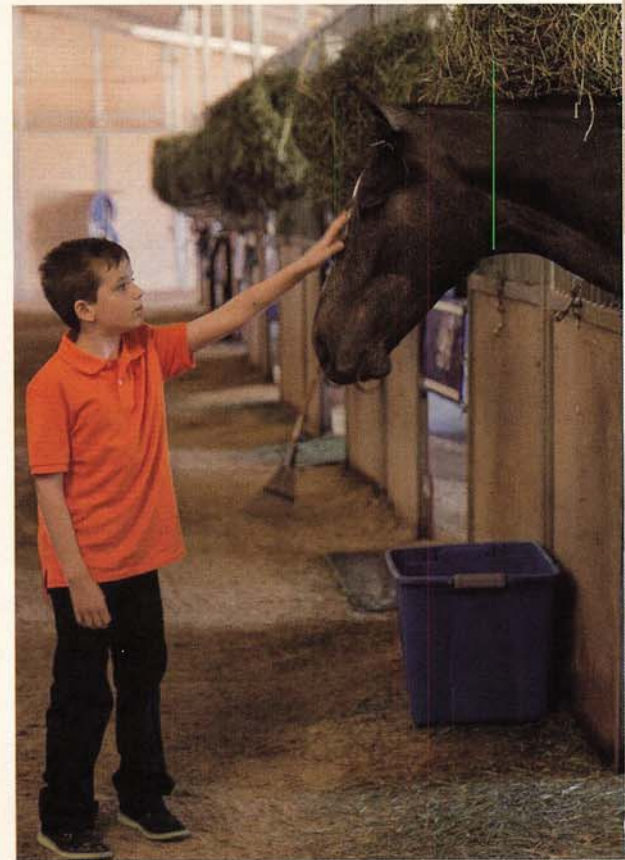
Above: Like father, like son Below: To Race is to Dream!