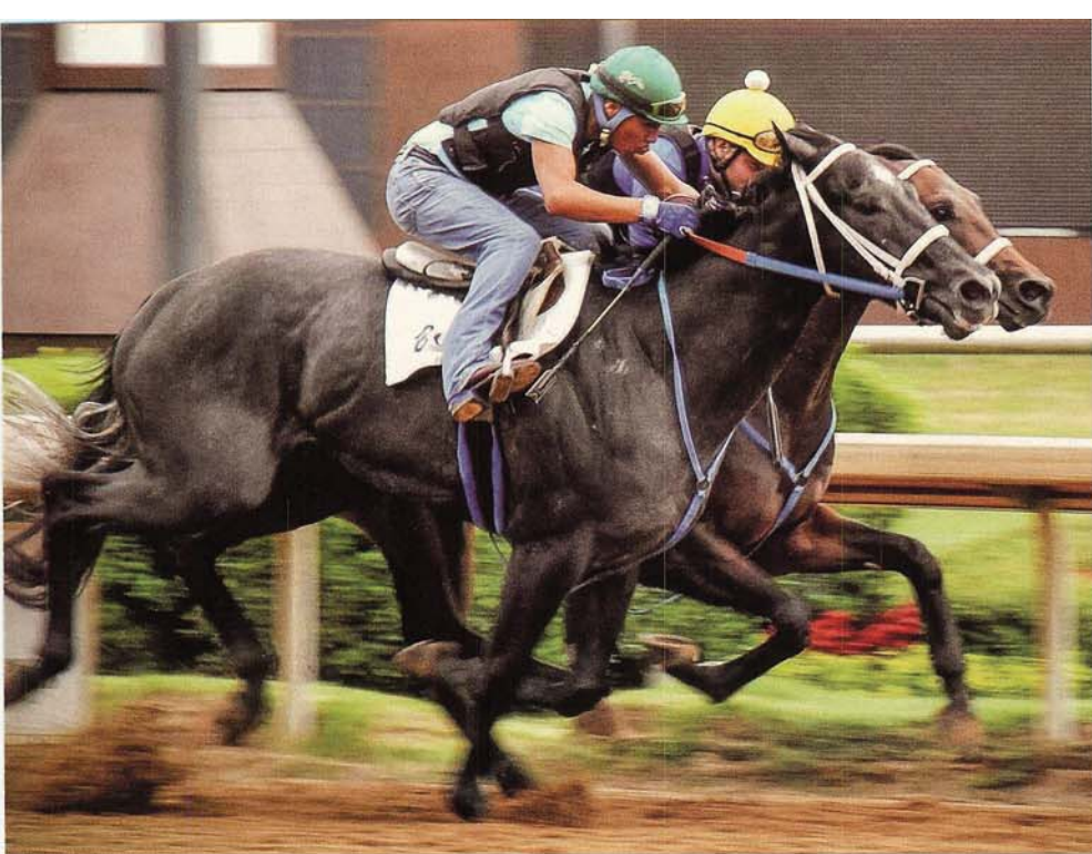
Love to run!